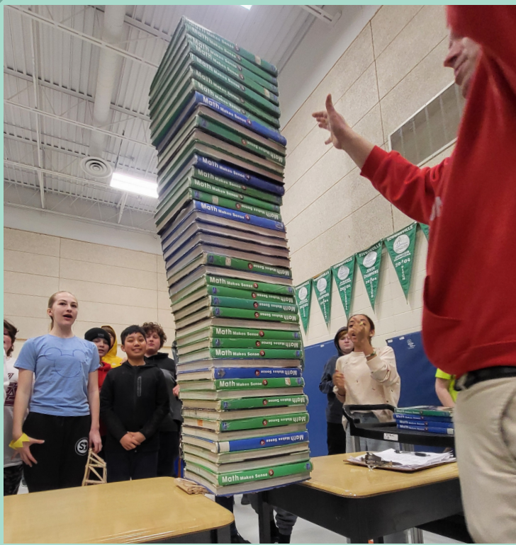
The winning bridge holding 44 textbooks.

The 2023/2024 annual bridge building competition was a huge success! New records were set and there was a high participation rate from all Intermediate classes, making it memorable for the school community.